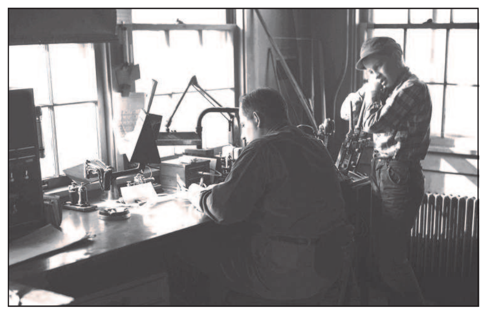
A young boy appears captivated by the sight and sound of a telegraph operator copying Morse code at Illinois Central's Tolono, Illinois tower in 1960, near the end of telegraph on American railroads.

Morse experts concede that the telephone, the typewriter and the teletype seldom fail and, as I pointed out, do the work more easily and more rapidly. Few train dispatchers and ops would go back to the obsolete system if they could. But now and then you'll run across a mellow old boomer who sighs for the snappy Morse dialogue on the dispatcher's wire that is fast becoming a lost language.