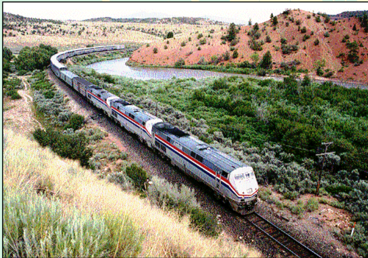
Amtrak's "California Zephyr" passing through western Colorado

Where am I going with all of this? Well, the first goal of this piece is to establish that I am a fan of Amtrak. In addition to the very good service I've experienced on most of my trips, I have several friends who either work for, or are retired from Amtrak, and some of these spent their entire railroad career at Amtrak. Amtrak is a serious organization, and is always represented at various rail engineering conferences by talented and capable individuals, just like the other railroads. Want to talk about railroad technology, engineering, maintenance-of-way and equipment performance? Tee up a conversation with members of Amtrak's engineering team, and you'll be talking to some of the best around.