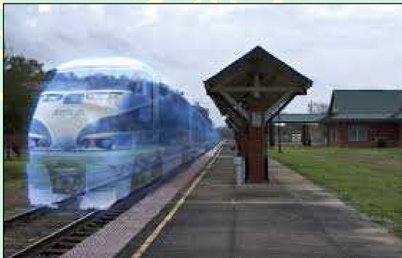
Will Amtrak survive or just fade away?

Some say that we should properly fund Amtrak, make it robust, or drop it altogether. I can't bring myself to say that dropping it should be an option, but I certainly understand the sentiment of those who do. The political and financial games that have been rained down on Amtrak by Congress for nearly half a century must stop. Failure to do so is disrespectful and insensitive to those who rely on rail passenger service for transportation, those who could rely on it more, Amtrak's employees, and, frankly, the American people.