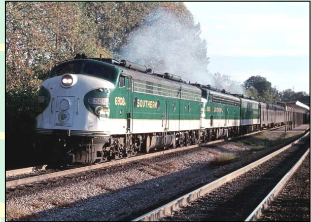
Southern Railway's "Southern Crescent" departing Atlanta's Brookwood Station in late 1970's

I didn't have an opportunity to ride the Amtrak Crescent , or any other Amtrak service until many years later, and as I've posted in a couple of stories on my blog ( davidclester.com ), my experiences on Amtrak have been relatively good. In addition to riding the Crescent to both Washington and New Orleans several times, I've also enjoyed trips on the California Zephyr , the Coast Starlight , Amtrak California, the Acela and other trains on the Northeast Corridor. All of the trips were good, and some were outstanding.