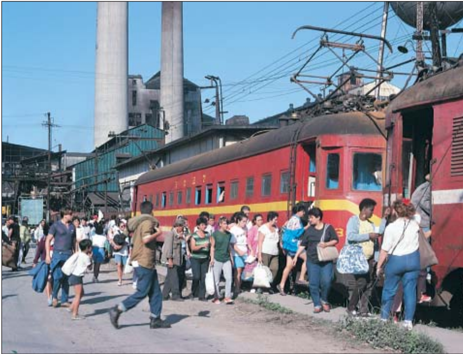
Sugar mill workers rush to board ex-Hershey Cuban's No 3027 on March 22, 1996. Both the railway and the former Hershey Chocolate mill are owned by the government.