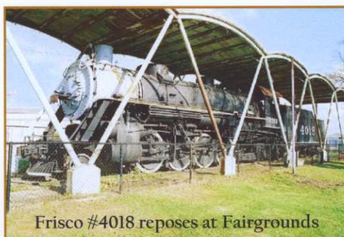
Frisco #4018 reposes at Fairgrounds

Built in October 1919 by the Lima Locomotive Works of Lima, Ohio, No. 4018 is a USRA 2-8-2 Light Mikado-type of the “War Baby” class ordered through the United States