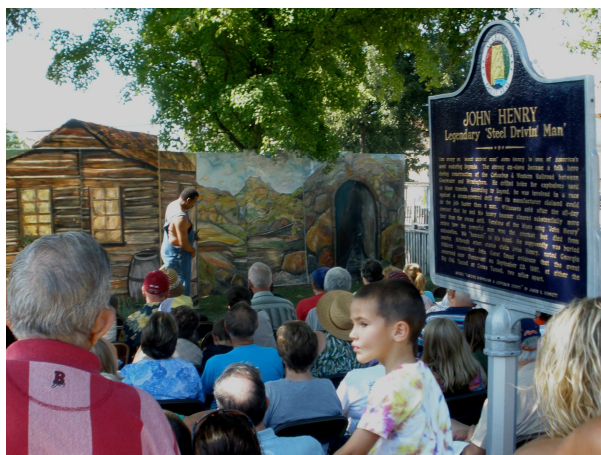
Outside, it was standing room only for a performance of the John Henry play, "Hear That Cold Steel Ring"