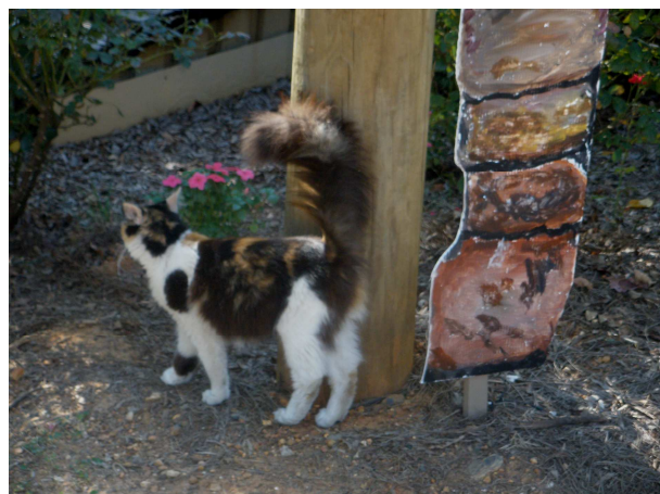
Even Chessie the depot cat found a spot to watch the play while waiting patiently for a handout