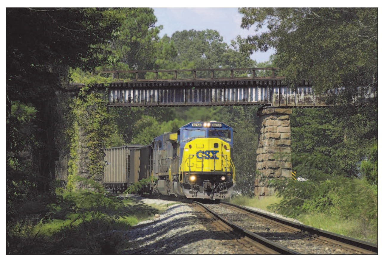
On Norfolk Southern Rail, an eastbound coal train from the North River mine passes beneath the Cane Creek branch, lead by CSX power. The lead unit, #8758, is a former Conrail SD60M. The NS trackage is a remnant of the original Georgia Pacific that connected Atlanta with Greenville, MS. The trackage from Columbus, MS to Greenville was later sold and became the Columbus & Greenville Railway.