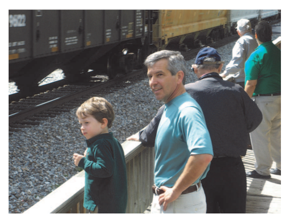
Father and son skip the wedding party across the street to join the fun on the platform