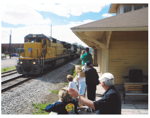
You should been looking to the west, fellas!