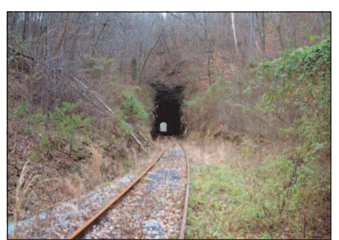
This is the west portal of the tunnel near Flat Top. This end has no mantle dressing the opening. Apparently, the rock at the west end of the tunnel has been stable enough to not require a liner or face support.

Over the years, the Cane Creek branch evolved into a frequently changing route that followed the coal sources, serving the Sayre, Cliff, Praco, Labuco, Maxine, Bessie, Flat Top, Palos, and Chitopa mines