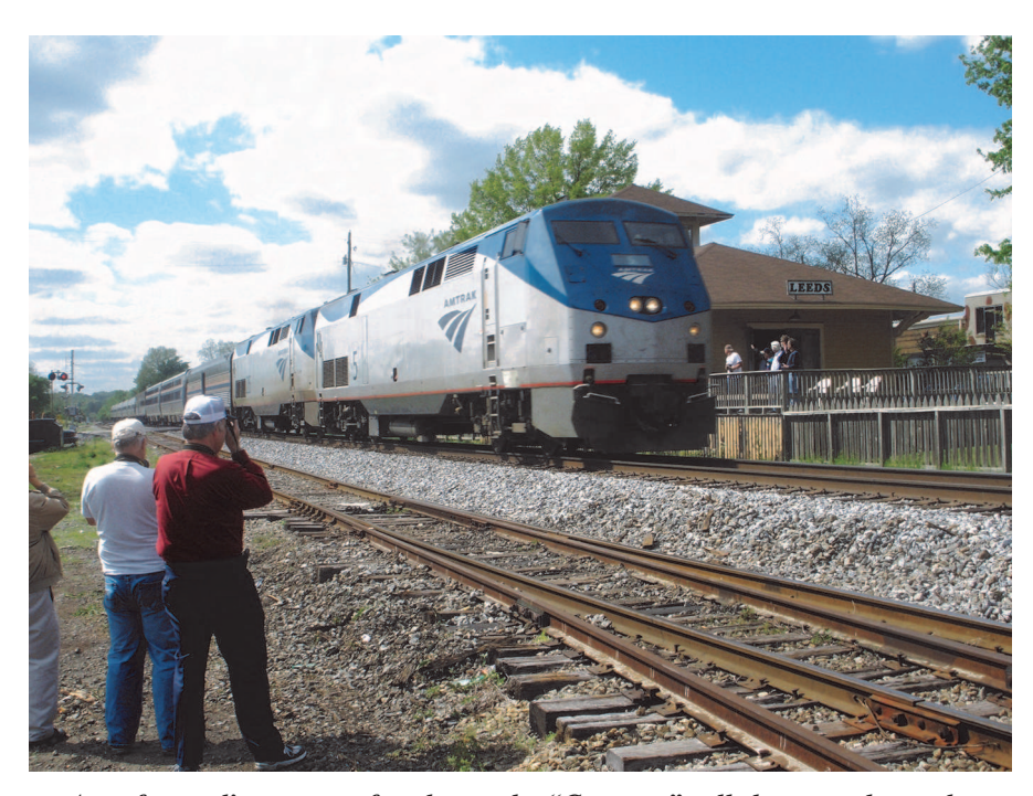
A perfect ending to a perfect day as the "Crescent" rolls by at track speed +