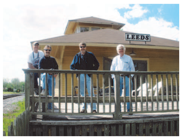
All eyes to the east (where is that train, anyway?)