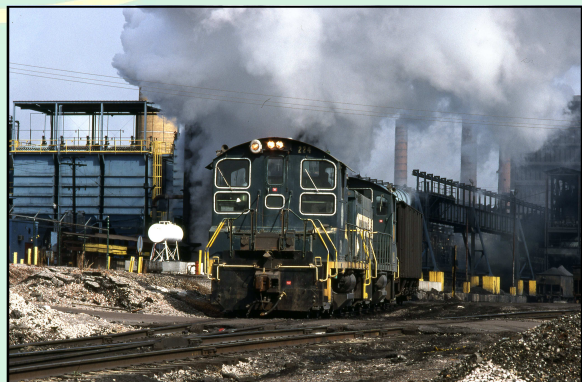
BS switching at Woodward, AL