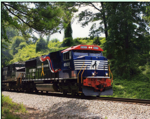
NS Veterans unit, by Greg Owings