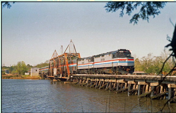
Amtrak "Sunset" in Florida