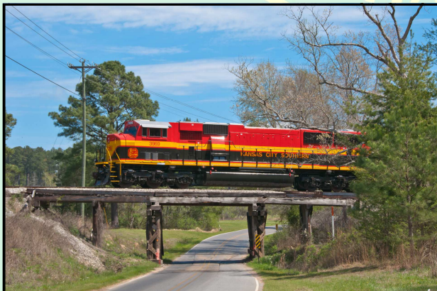
Kansas City Southern at Meridian