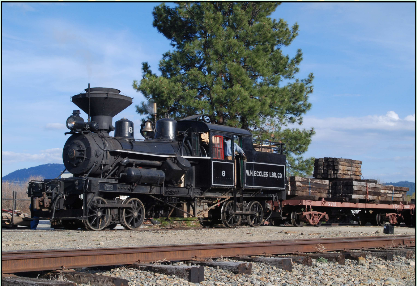
Crewmen preparing Sumpter Valley Railway Heisler #3 for a photo charter in McEwen, Oregon on May 14, 2010.