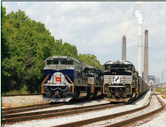
NS power at Wilsonville, AL