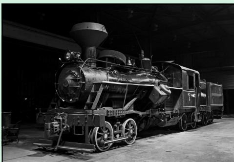
Cass Scenic Railroad #6, a Heisler, in the Cass Shops, May 17, 2012.