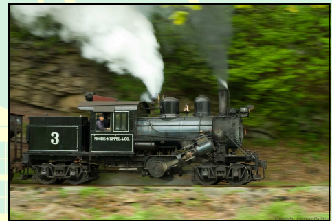
Moore-Keppel Climax #3 running along the Greenbrier River at Durbin, West Virginia on May 17, 2009. Used with permission. Copyright Jonathan Hallman

... the early designs used two cylinders mounted on the center line of the locomotive, which powered a set of spur gears connected to a longitudinal shaft linked to the trucks by means of universal joints and sliding shafts to permit them to swing freely, while bevel gears were used to transmit power to the wheels. A lever permitted the Climax to obtain two gear ratios, based upon torque requirements. A later version, in 1891, used inclined cylinders, one on each side of the boiler, and in 1903, Climax developed a three-cylinder version. (6)