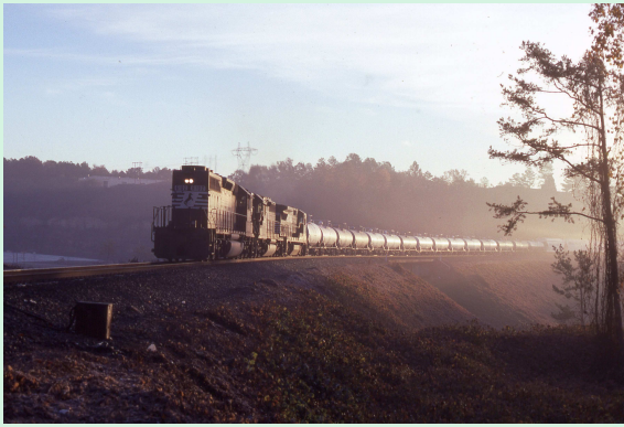
NS tank train at Lovick, AL