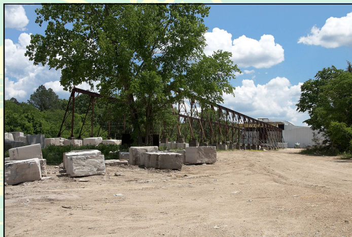
The mill building is at the far end of the gantry. Here the oolitic limestone is cut to dimension and the final finish is applied. This is the building that was converted during World War II into plant to manufacture shells for the war effort. The Fossick branch came toward the camera on the right side of the mill. There seems to be room for a small yard