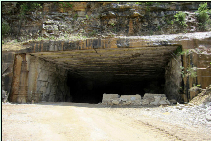
This is the second or third mine opening since the company began mining underground. The mine entrance looks to be nearly forty feet wide and about eighteen feet high. The wife of a previous owner of the company hired artisans from Russia to do the sculpturing on the left side of the entrance and across the mantle

The oolitic dimension stone was gaining National recognition in its own right. Noted for its beauty, hardness and durability, this product was sought after for the façades on premium buildings in cities and universities.