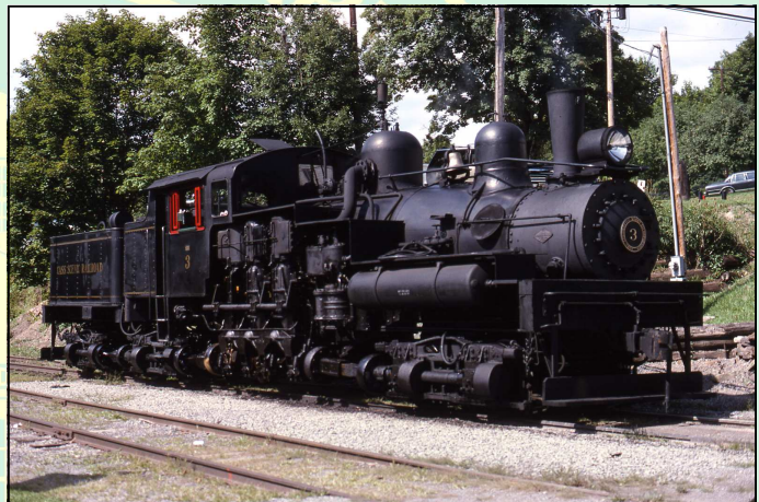
Shay #3 at Cass Scenic Railroad on September 12, 1992.