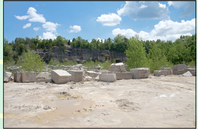
Large stones line the edges of the road through the complex. An entrance earlier mine can be seen just to the right of center in this photo.