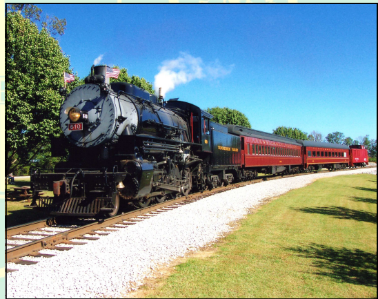
TVRM #610 at Grand Jct.