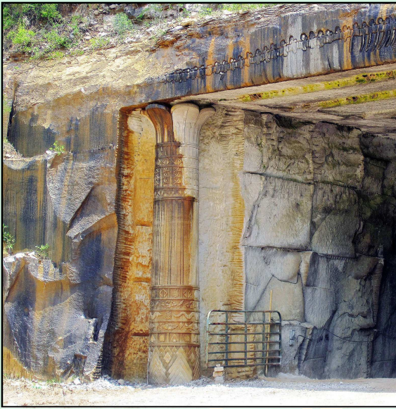
This is a closer look at the sculpturing that is on the left side to the mine's active entrance.