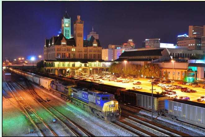
CSX at Nashville, TN

The finalists for the Mid-South Chapter's 2014 Member Photo Calendar contest were chosen in July by member vote, and the editors have selected the winning images based on overall composition and subject matter. The 2014 calendar will be available in the Company Store in time for holiday gift giving. Once again, Mid-South members who renew their membership for 2014 by December 31st will receive a complimentary calendar. We are pleased to preview the selected images by name with a brief caption. Congratulations to the winners, and thanks to all of the talented photographers who contributed!