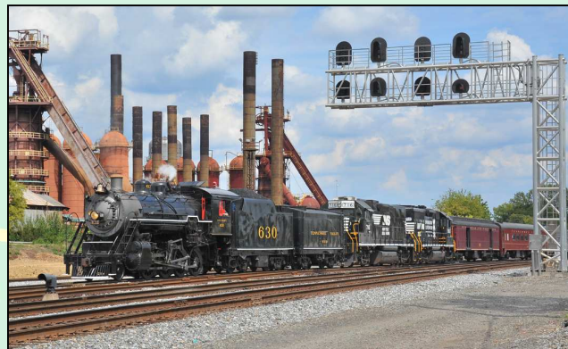
#630 passing Sloss Furnace in September 2012

On the weekend of September 14 & 15, the " Steel City Rail Adventure " will operate two round-trips daily behind ex-Southern Railway #630. Staffed and operated by the Tennessee Valley Railroad Museum of Chattanooga, the half-day trips will feature climate-controlled coaches with comfortable seats and large windows. A commissary car selling snacks, soft drinks, and light food items, along with souvenir items, will be part of the train. All trips will depart from the former site of Birmingham Terminal Station (enter from Second Avenue, North at 26th Street).