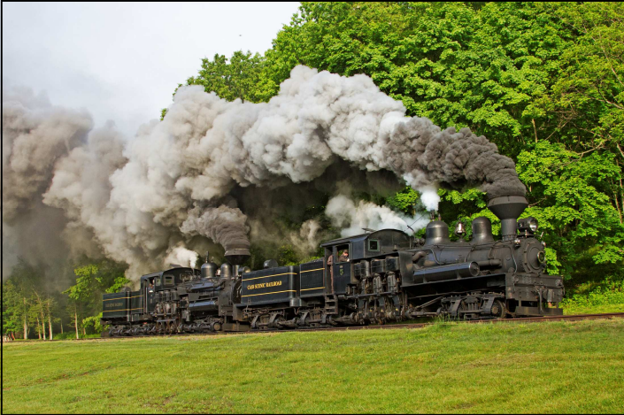
Cass Shays #5 and #11 making switching moves at the Cass Scenic Railroad before coupling on to their log train on May 18, 2012.

While the early Shays had a vertical boiler and two vertical cylinders, most Shays were built with a horizontal boiler and three vertical cylinders, as this proved to be a more practical design. The boiler was set to the left side of the engine to allow room for the vertical cylinders on the right. And, Shays were built with either two trucks or three trucks, depending on the amount of power needed by the customer.