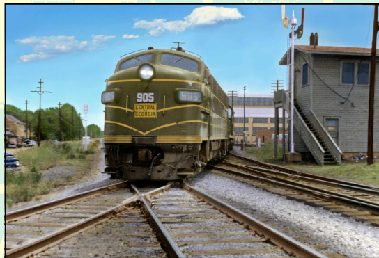
CofG freight at Woodlawn Jct, by Marv Clemons