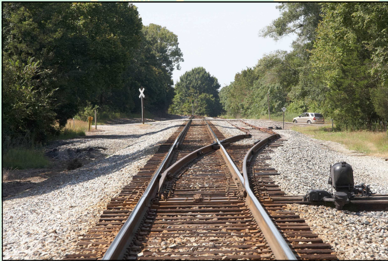
Surprisingly, a short piece of the Fossick branch still exist. This view is looking south, down the Northern Alabama main. the only portion of the Fossick branch, that apparently remains active, is from this switch, to just beyond the Norfolk Southern's distant signal, at the 248 mile marker.

trees that have grown over it. The rails have been removed from US-43 and the track ends short of Alabama Stone's Rockwood plant.