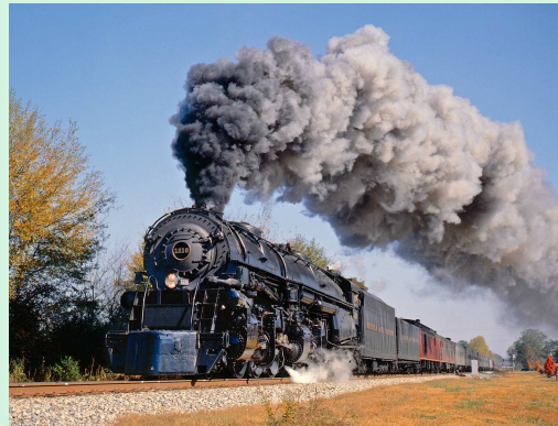
N&W #1218 in Georgia