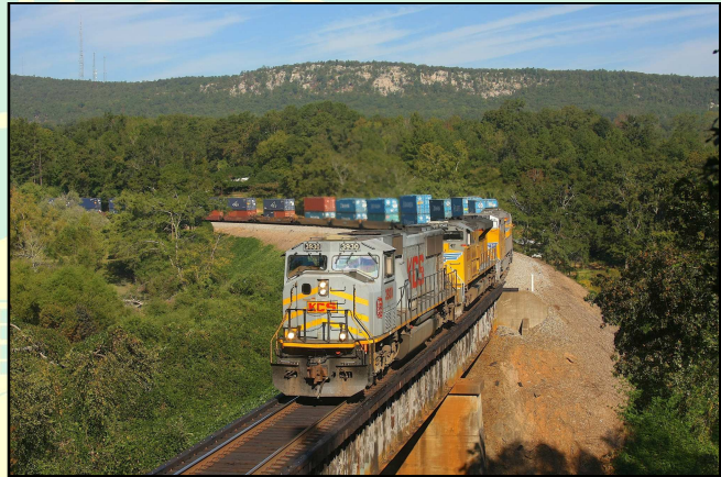
NS intermodal at Cook Springs, AL