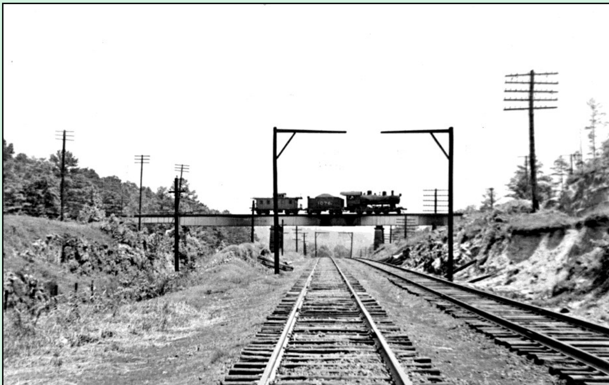
Two of the editor's favorite Matt Lawson photographs show (above) the L&N Red Gap turn crossing over the Southern and Central of Georgia main lines en route from Irondale to English Village. Below, the Red Gap local is sauntering along the Red Gap Branch crossing a short trestle over the site of Oporto Road. Note the conductor and flagman out on the caboose platform just enjoying the ride. Rail photography doesn't get any more "local" than this, folks.