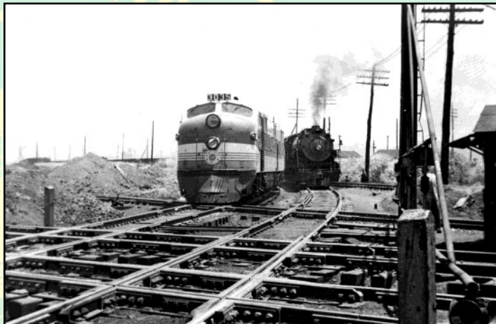
Trailing Seaboard passenger units bring up the rear of the Silver Comet consist en route to 32nd Street yard