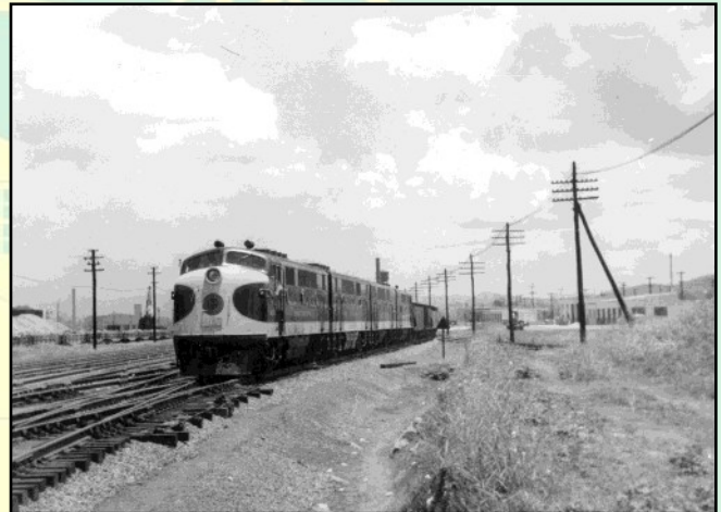
Southern Birmingham Division freight with new matched set of FT units arriving from Atlanta en route to Finley Yard