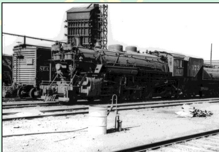
Seaboard light Mikado #373 rests at 32nd Street yard