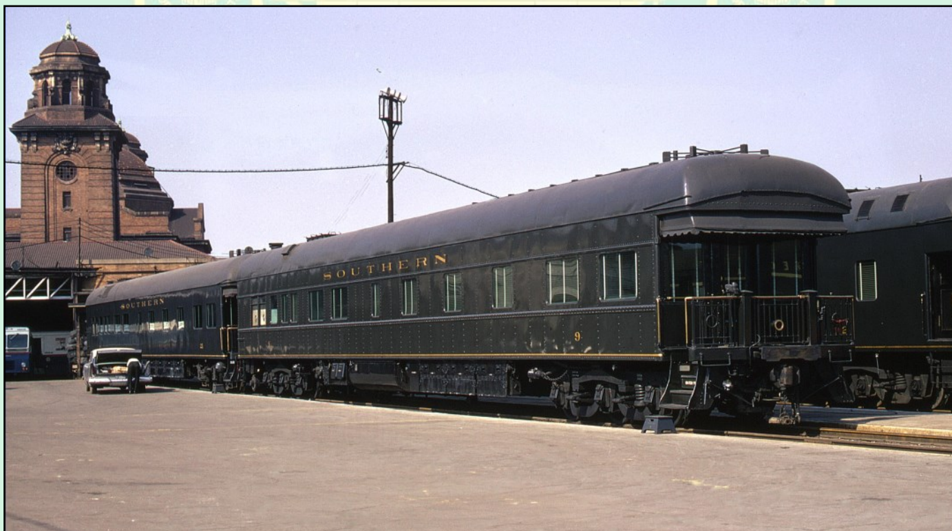
Railroad office cars visiting Terminal Station were conveniently parked next to the paved entrance to the "Pullman yard." On the day of the author's visit, Mr. Dillard's car Savannah was parked at the above location and nearest to the station.