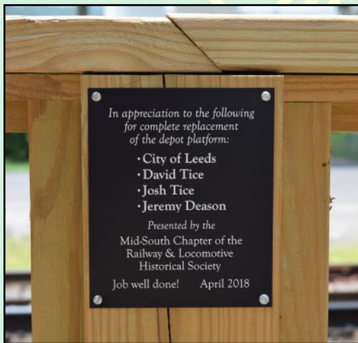
Presentation plaque mounted on the depot deck