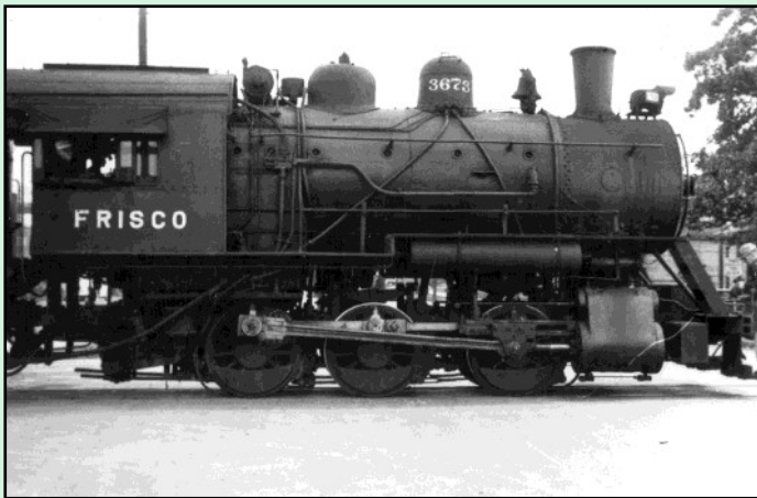
Frisco's little 0-6-6 switcher was assigned to switch Terminal Station and worked the Birmingham Belt Railroad