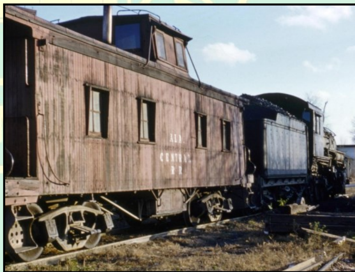
Alabama Central's caboose was formerly Southern Railway

In December, Southeastern Metal was awarded the contract to scrap the remains of engine No. 28, which was sitting at Marigold sans pilot wheels on the only section of rails still owned by the railroad, and the half-dozen or so hopper cars that Marigold Coal Mining had bought from the Lackawanna several years previously for on-line use. The cars had been resting in mud since October, when the rails had been yanked from under them.