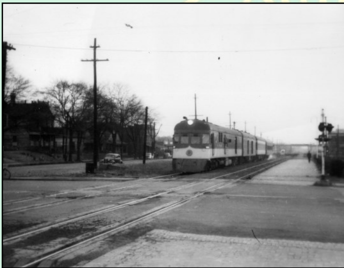
Southern's diesel motorcar The Goldenrod arriving in Bessemer en route from Mobile to Birmingham