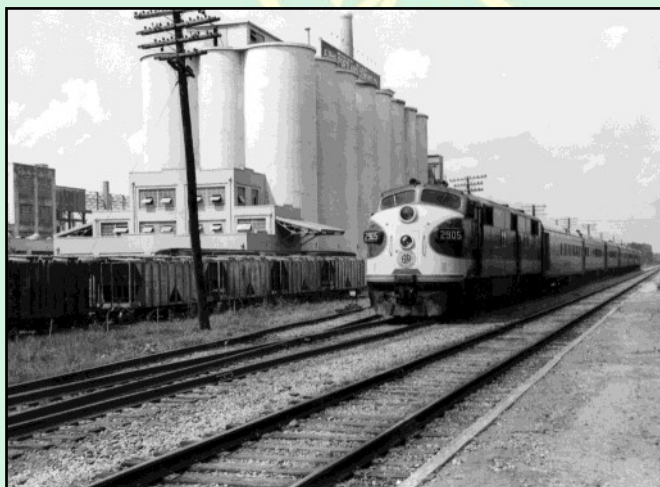
Southern's #47, the southbound Southerner is passing through Phenixville just north of Bessemer