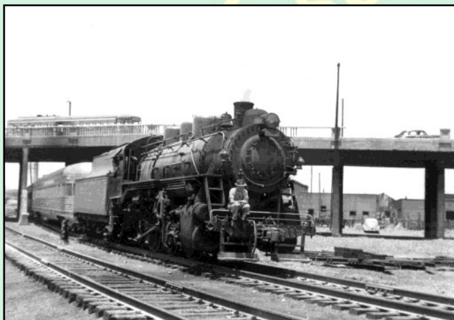
Seaboard's Terminal Station switcher drags the Silver Comet's consist to 32nd Yard for cleaning and servicing.

In the last issue, we presented an album of black & white photos taken in the 1960s around Birmingham by railroader Bill McCoy. This month we're stepping back a decade into the early 1950s, marking the end of steam and heralding the diesel age. Deceased MidSouth member Matt Lawson captured a representative sample of both steam and diesel action around the District, including early streamlined passenger train action around Terminal and L&N stations. Matt was kind to donate his collection of Birmingham images to the MidSouth Chapter archive, and we are happy to present a sampling of them for your enjoyment.