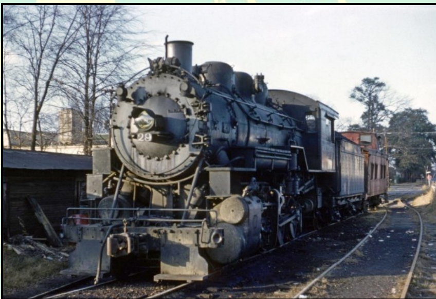
Alabama Central 2-8-0 #29 tied up in Jasper, Alabama, 1961