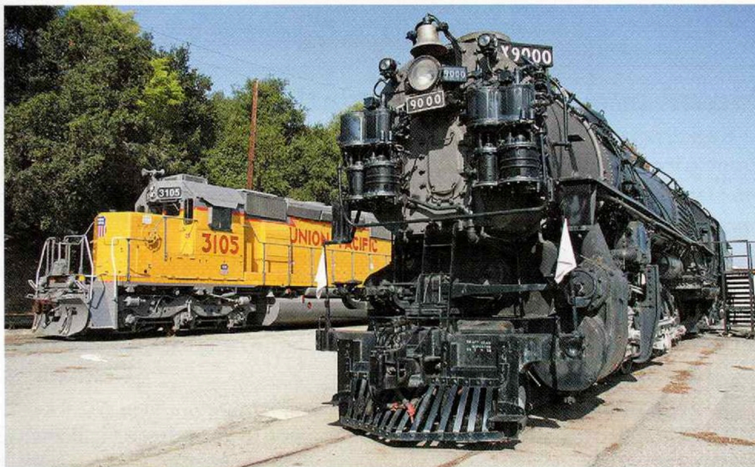
UNION PACIFIC STEAM AND DIESEL share the spotlight at RailGiants Train Museum, with operational Electro-Motive Division SD40-2 unit No. 3105 at left and 4-12-2 engine No. 9000, first of its class (Alco, 1926) and largest of the few surviving North American three-cylinder steam locomotives.

Buses will depart before lunch, returning attendees back to the Double-Tree or, for those having afternoon flights, to Ontario International Airport.