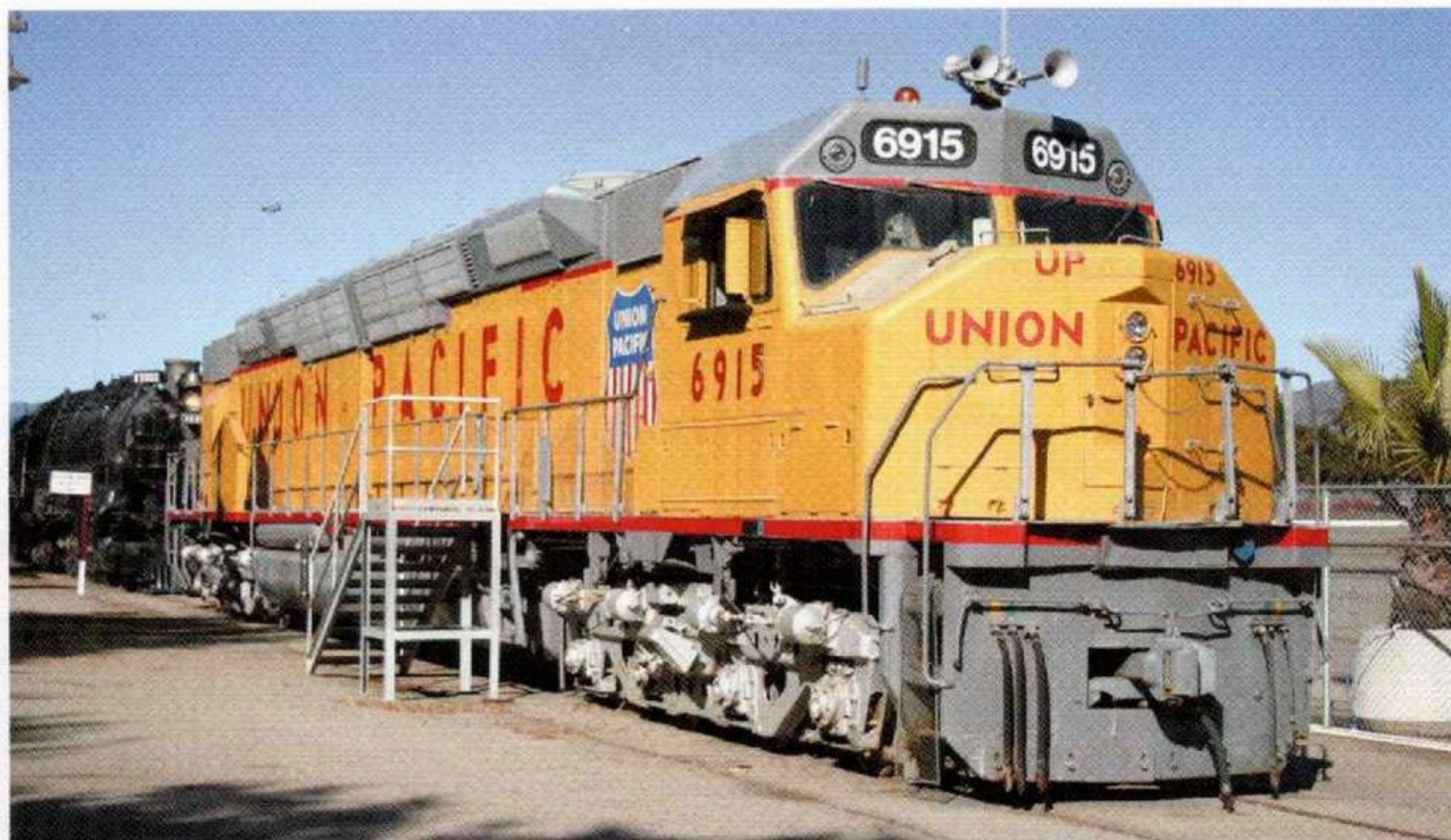
A STAR attraction will be UP's Centennial DDA40X double-diesel unit No. 6915.

• Attendees will board air-conditioned motor coaches to travel to the Chapter's RailGiants Train Museum in Pomona. Bush will give a walk-around tour of the only surviving 4-12-2 engine, UP No. 9000.