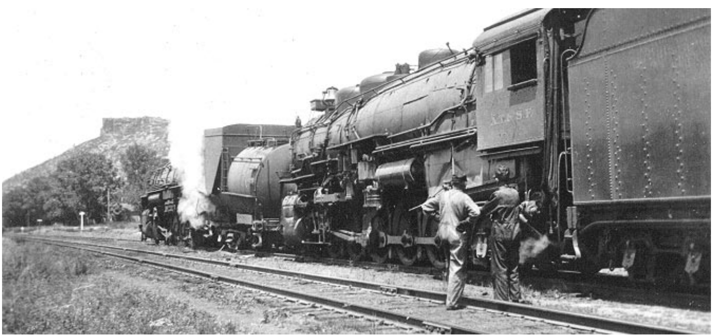
"Well, jack it back up and let's go." See page 4 for more information.