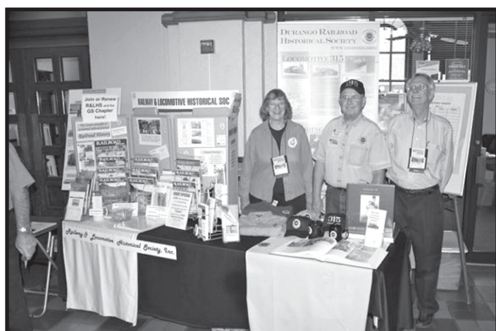
R&LHS table at the Ogden, Utah event.

The New Year has started out strong with more than 60 new R&LHS members signed up at several shows during January and February. The results are shown above. Check out the photos from some of these shows, in this issue of the Quarterly Newsletter: