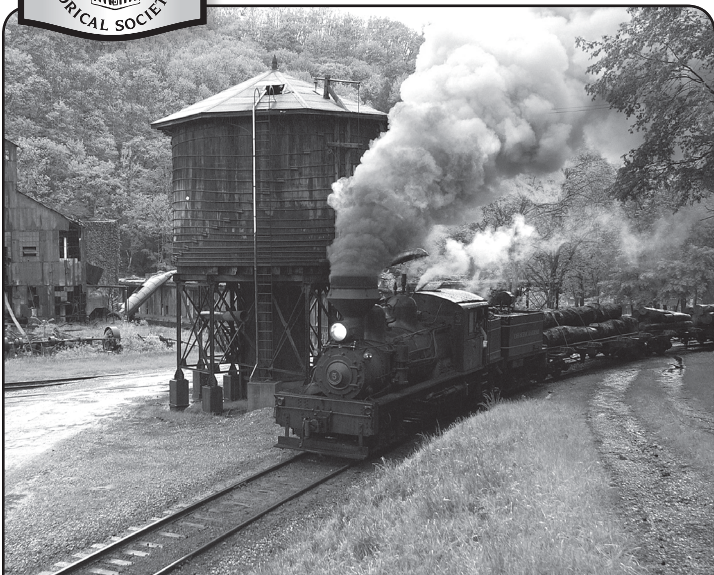
A log train on the Cass Scenic Railroad ~

Spring 2011 • Volume 31, Number 1 • www.rlhs.org